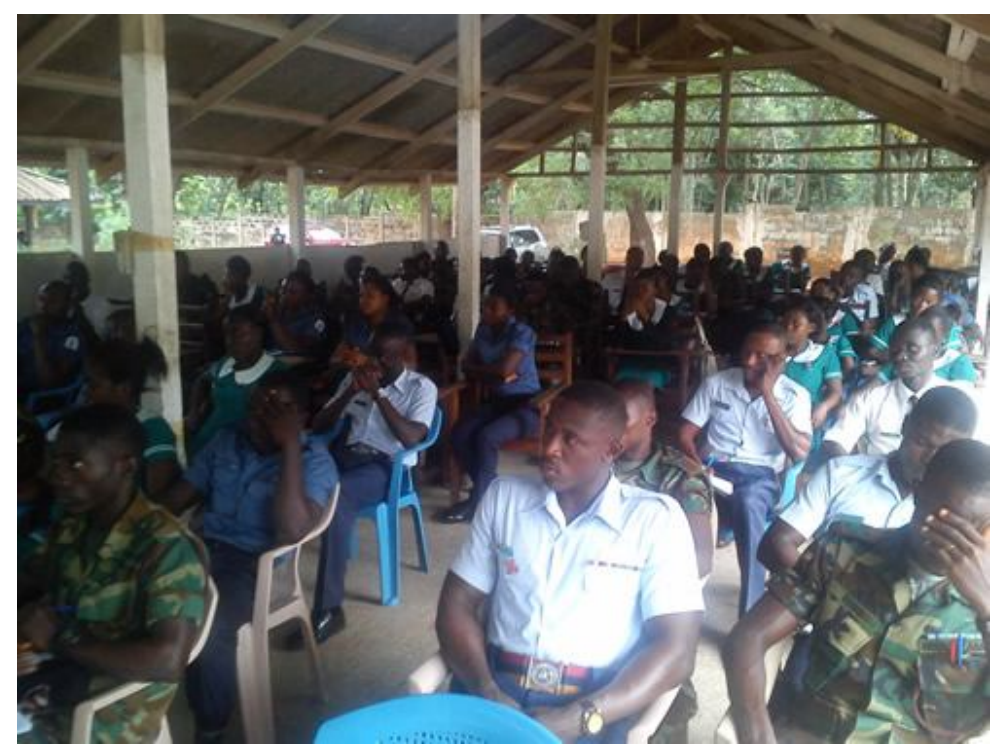
Participants at the health forum

Information technology has revolutionized everyday life from the way we manage our finances to how we watch movies. Technology advancement is changing the way we address health of our communities thereby making big impact and changing how healthcare is being addressed.